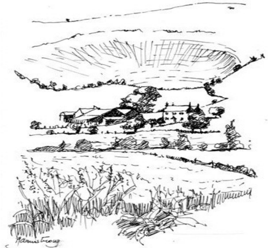
Whitecliff Farm Brixton Deverill